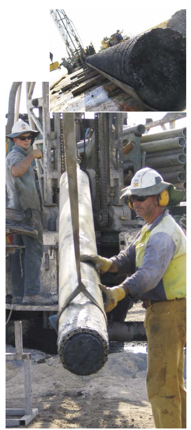
Drilling activities during the year at Lake Lindsay provided vital information allowing us to plan safe, efficient and environmentally sound development in the future.

There are currently four geologists in the Anglo Coal Australia graduate program. A three–year program of training and work experience provides recent university graduates with the basic skills required for their chosen profession.