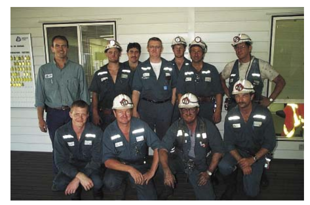
The 'C' Crew cut the first coal at our Grasstree Project in Queensland, which progressed ahead of schedule in 2003.

At December 2003, 26 full time Anglo Coal Australia staff were working within the Projects and Resources group. On average, around 80% of field exploration crews were contractors, while the percentage of contracting personnel on projects varied throughout the year.