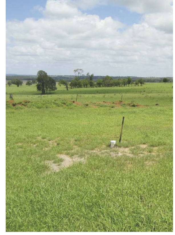
A typical bore drilling site, showing the site after decommissioning (before rehabilitation), and after rehabilitation has been completed.